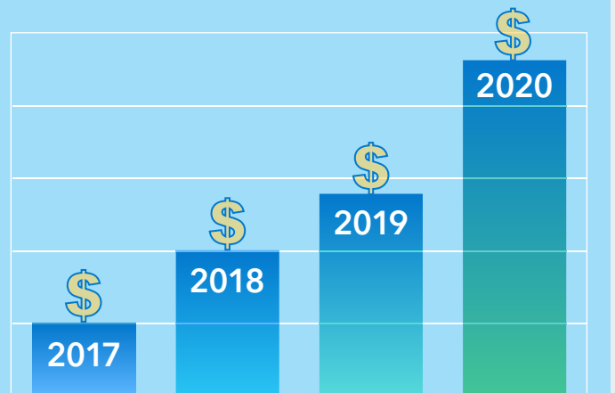
MASP and xSP revenue growth