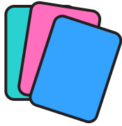
Different colored paper (tissue or construction paper)