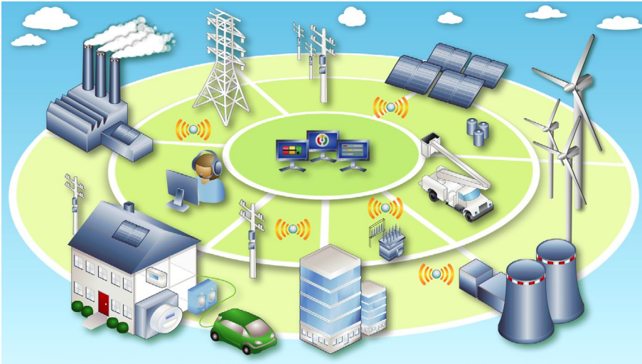
Figure 1: The smart grid is a network of assets, connected by intelligent devices, that delivers electricity to consumers.

electric vehicles and home area networks are changing that view. Utilities now understand that the behavior of all the different users of air conditioners, televisions, water heaters, hybrid electric vehicles and other appliances contributes to the loads of households throughout the day. As a result, utilities will be required to understand demographics and user profiles. For example, utilities must grapple with the possibility that an increasing percentage of their customers' vehicles will be plug-ins, and they must consider the implications that will have for demand.