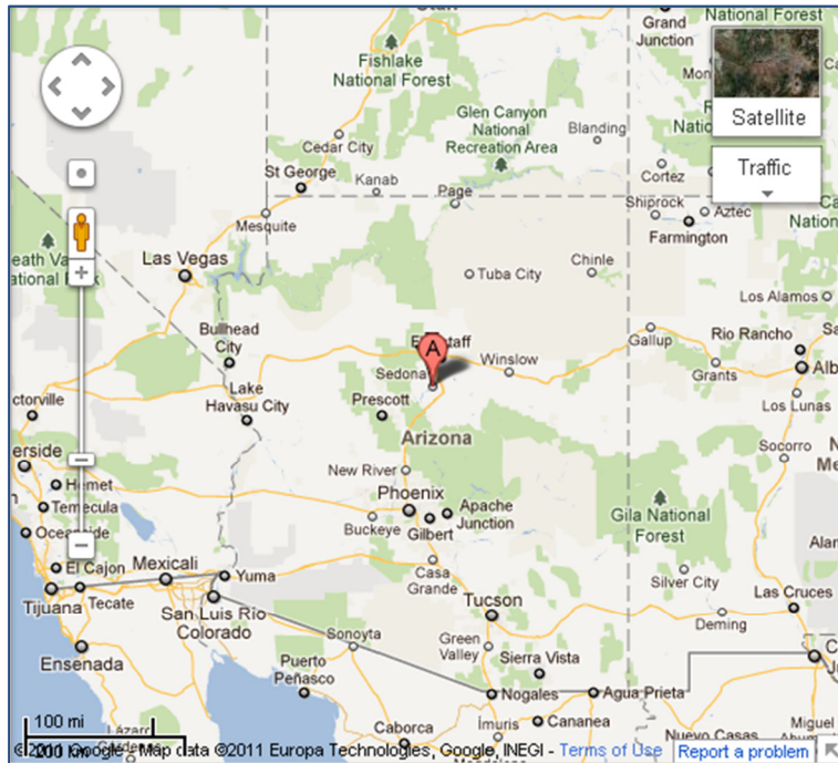
Figure 3 – Example Google Map resulting from running the program's code

And, not only do you get to see where the picture was taken, but you can manipulate all of the ActiveX controls, thus you can zoom in or out, change the altitude, and move any distance in any direction. Thus, if you didn't know where Sedona, Arizona was, you could easily zoom out until you were far enough away, like the screen shot shown below, where you could easily see that Sedona, AZ is just south of the Grand Canyon and South-East of Las Vegas.