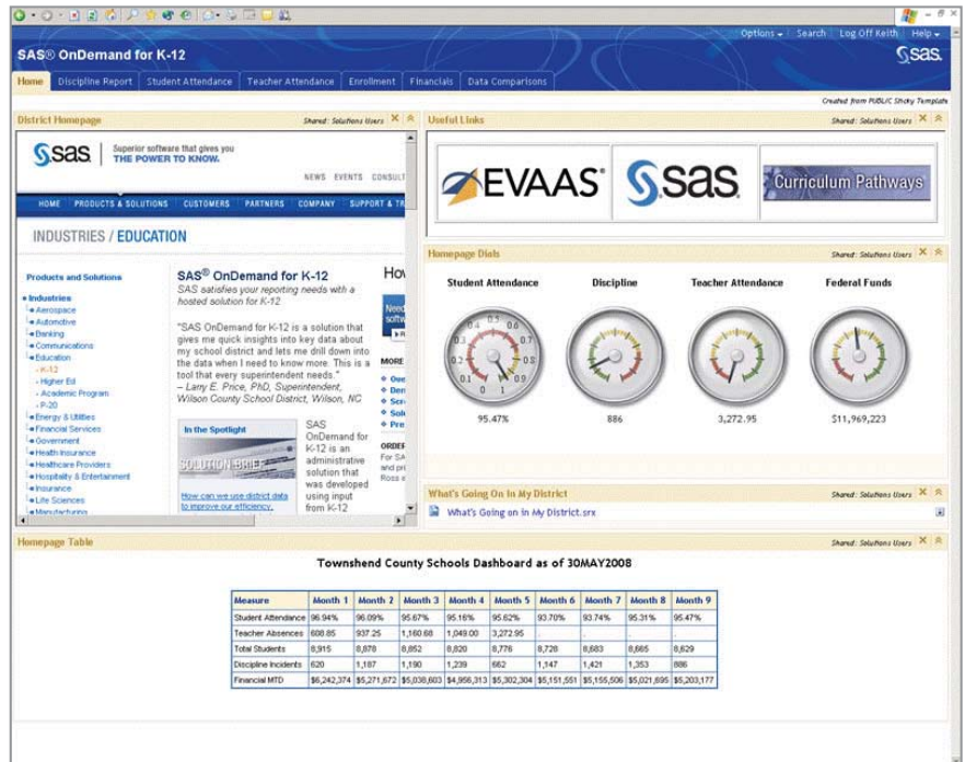
The portal home page provides a snapshot of a district's current status.

A computer and high-speed Internet access are all that's needed to get up-to-date reports at your fingertips.