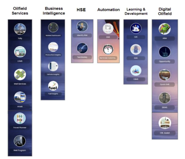
Unified interface tailored to serve unique digital application requirements.